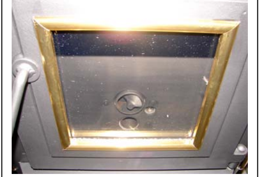
Finished on stove Ill. 6