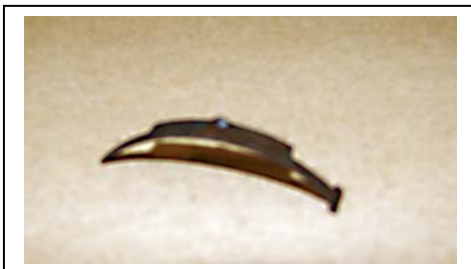
Half moon spring clip Ill. 2