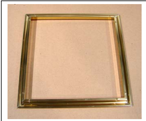
Window Trim Ill. 1

Window trim can be attached by using the provided “half moon” spring clip(s) and some high temperature silicone (optional, silicone is not included). Insert the tee end of the spring clip into the channel on the edge of the trim (Ill. 3) – then, turn the clip and set the other end of the clip into the channel (Ill. 4). The spring clip will hold well if it is placed on the top edge of the trim before placing the trim in the window of the stove. Place the top edge with the clip into the window opening, then push the bottom edge of the trim flush with the window. We also suggest that high temperature silicone (not included) be used on the corners, to ensure the trim will stay in place (Ill. 5).