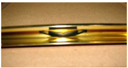
The raised portion of the spring clip should be facing the door of the stove Ill. 4